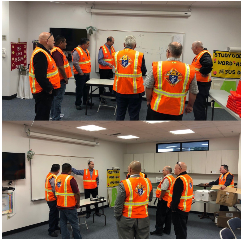
Easter Sunday Marshalls